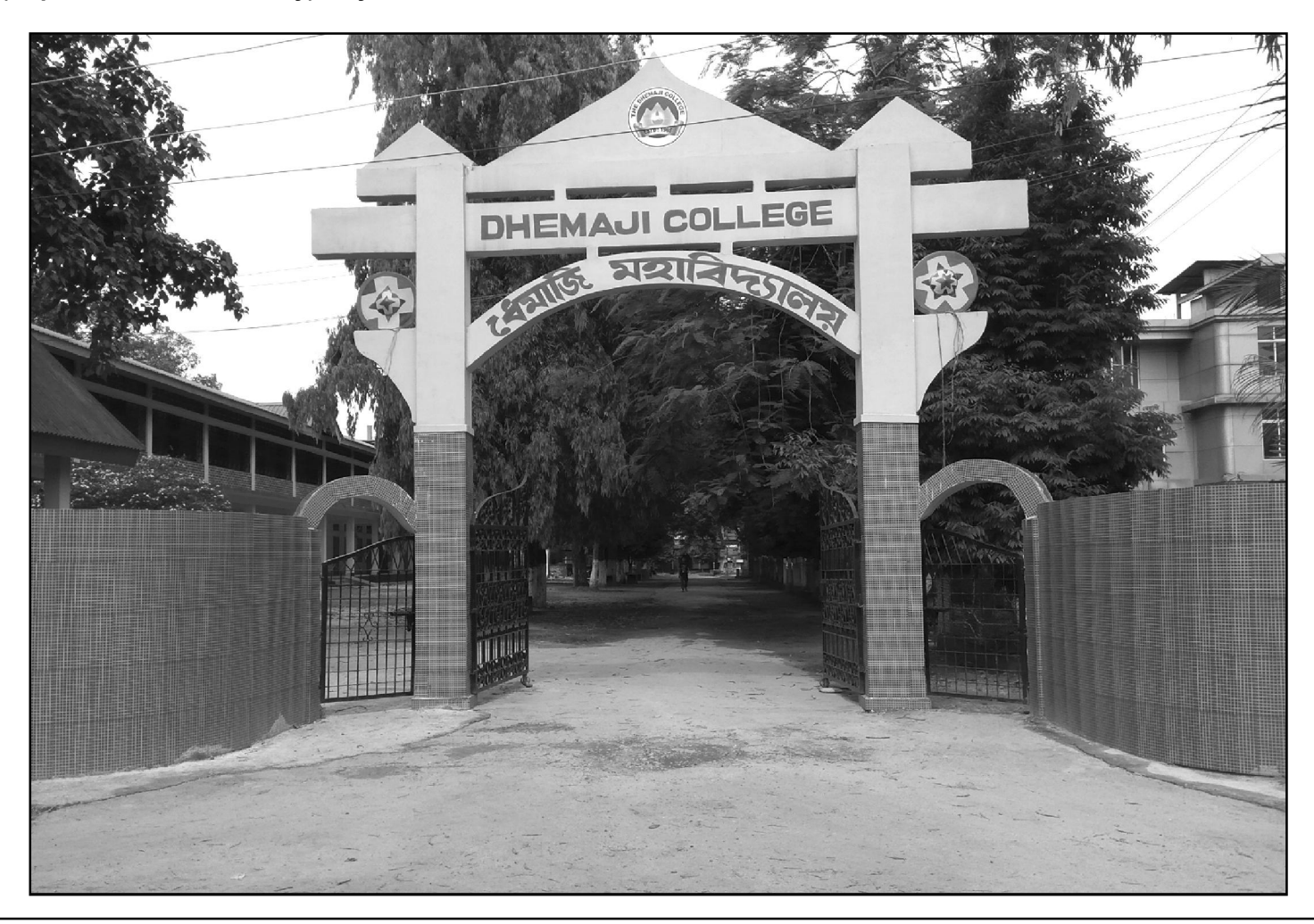
Printed at : Dhemaji Offset Printers, Ratanpur, Dhemaji-787057

Price : '150/- (Rupees One Hundred Fifty) only.